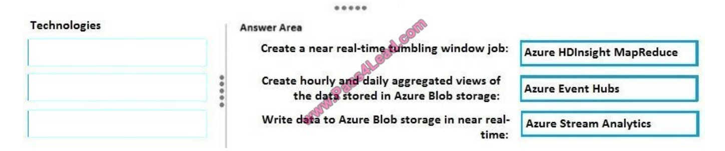
Box 1: Azure HDInsight MapReduce

Azure Event Hubs allows you to process massive amounts of data from websites, apps, and devices. The Event Hubs spout makes it easy to use Apache Storm on HDInsight to analyze this data in real time.